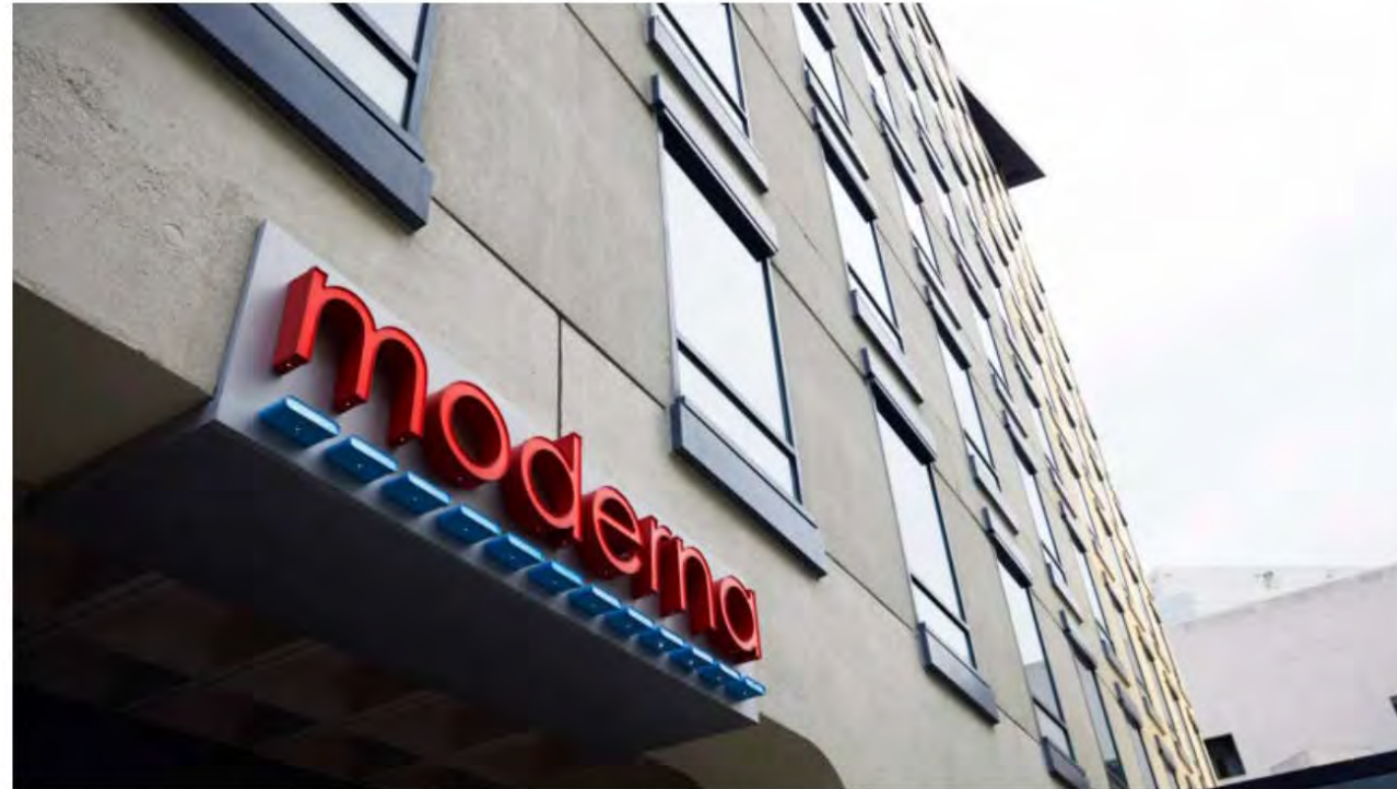
The Cambridge headquarters of Moderna.

"Massachusetts is, I would argue, the only place where this could have been developed."